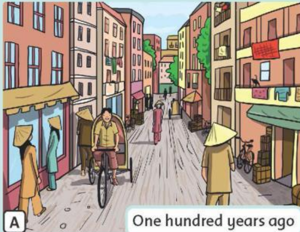
A One hundred years ago