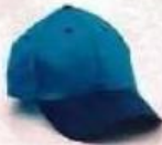
4 baseball hat / hoodie