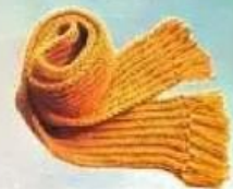
3 baseball hat / scarf