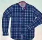
1 shirt / skirt