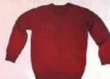
6 jacket / sweater