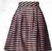
7 dress / skirt