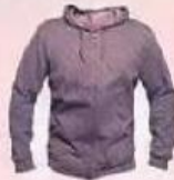
5 hoodie / sweater