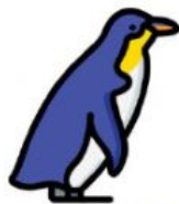
pen g uin