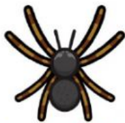
taran t ula