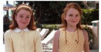
My sister and I