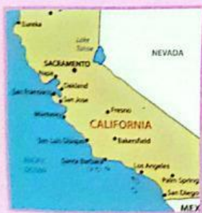
▲ California, USA

Oranges come from trees. These trees grow in warm places like California. Let's learn how oranges grow on a farm in California.