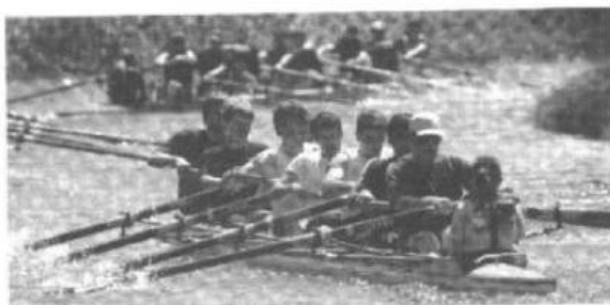
Members of the rowing team in a boat race

Management gurus often compare business to sport. They sometimes use examples from football or rugby when they talk about teamwork. But it isn't often that they say that rowing has lessons for business.