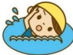
Swim in the pool