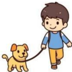
Walk the dog

2. What do we use computers for? (1 point)