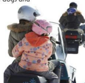
Facts about the Arctic