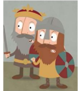
ANGLO-SAXONS (450 AD)