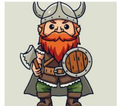
VIKINGS (800 AD)