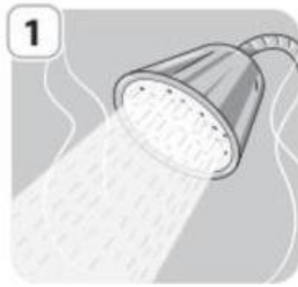
take a shower