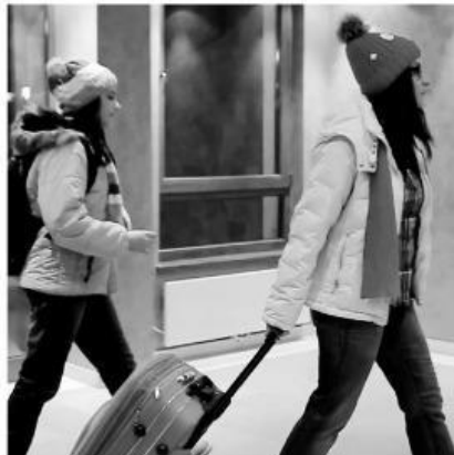
5 They're at a _____