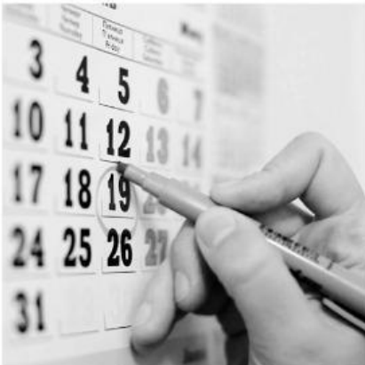
4 You need to choose a _____ for the reunion.