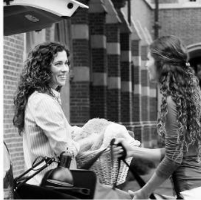
2 She's a _____ at university.