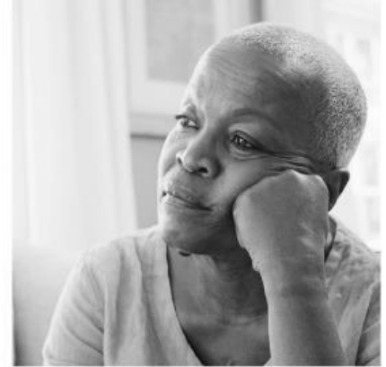
3 She misses her _____