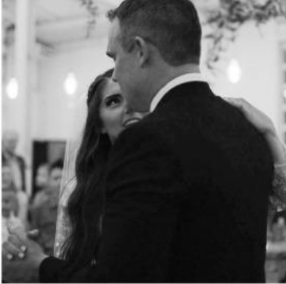
1 They're dancing at a _____