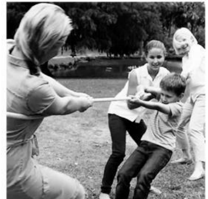
6 They're playing a _____