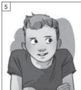
Alex is a _____.