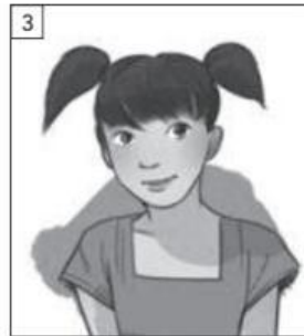
Kim is a _____.