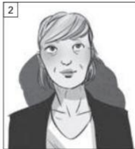
Mrs DeSouza is a _____.