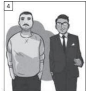
George and Michael are _____.