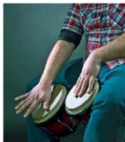
7 _____ the drums