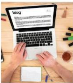
6 _____ a blog