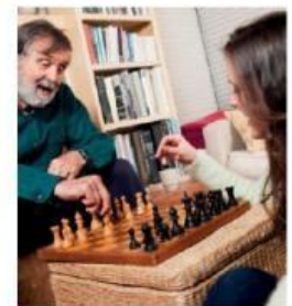
10 _____ chess