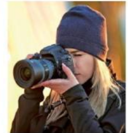
5 _____ photos