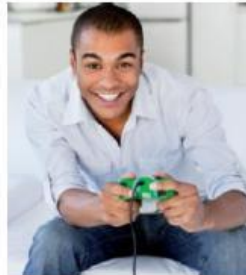
3 _____ online games 4 _____