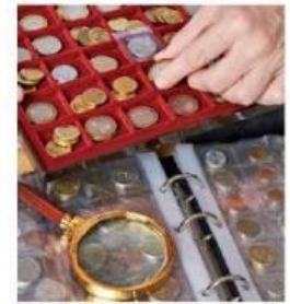
15 _____ coins

2 Match the hobbies with the descriptions.