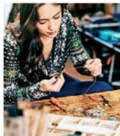
8 _____ jewellery