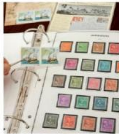
13 _____ stamps