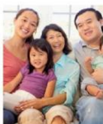
5 spend _____ with my family