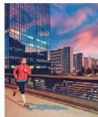
2 go for a _____