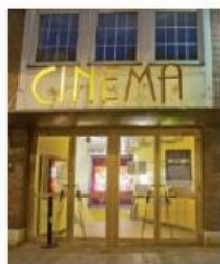
1 go to the _____

study book (my) friends read time walk guitar cinema TV dinner watch play radio listen run coffee film relax