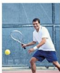
6 _____ tennis