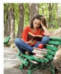
9 read a _____