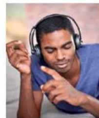
3 _____ to music