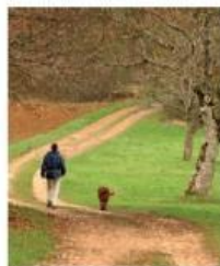
1 go for a _____