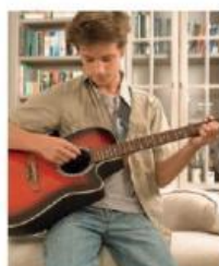
7 play the _____