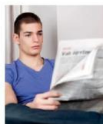
8 _____ the newspaper