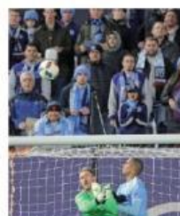
17 _____ football