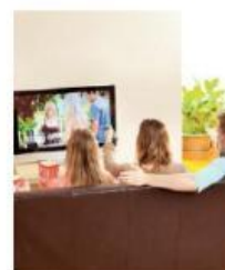
18 watch _____