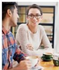
3 go for a _____