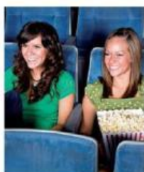
14 see a _____