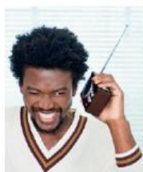
4 listen to the _____