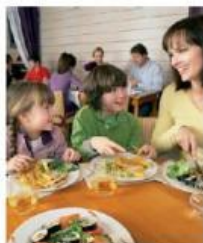
2 go out for _____