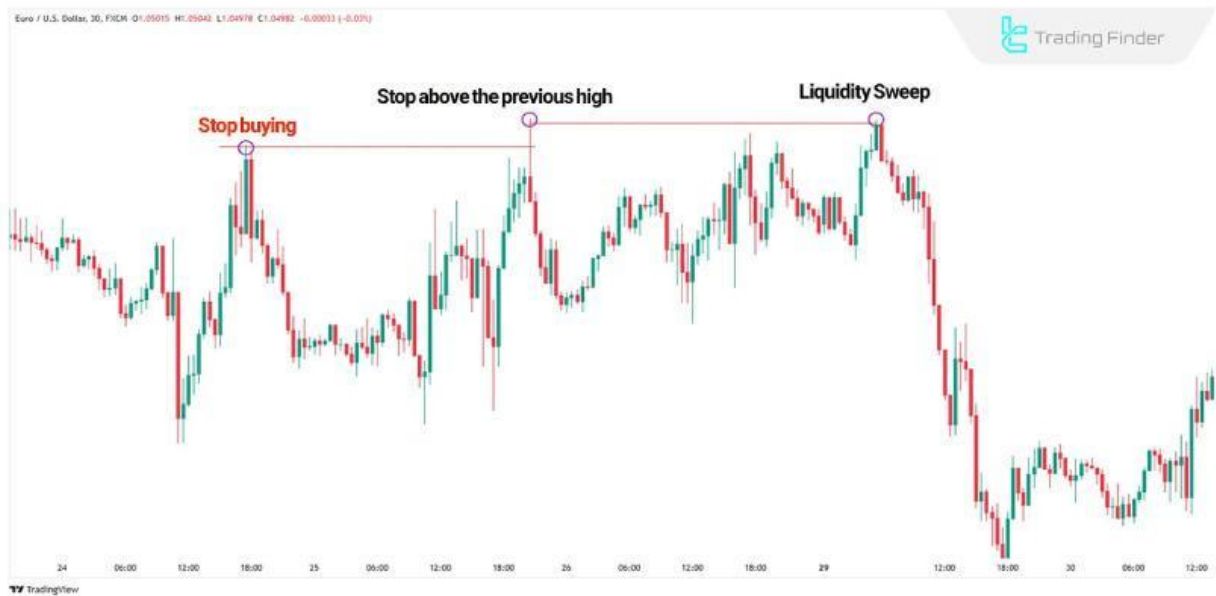
Illustration of three steps to mastering buy-side liquidity in forex trading