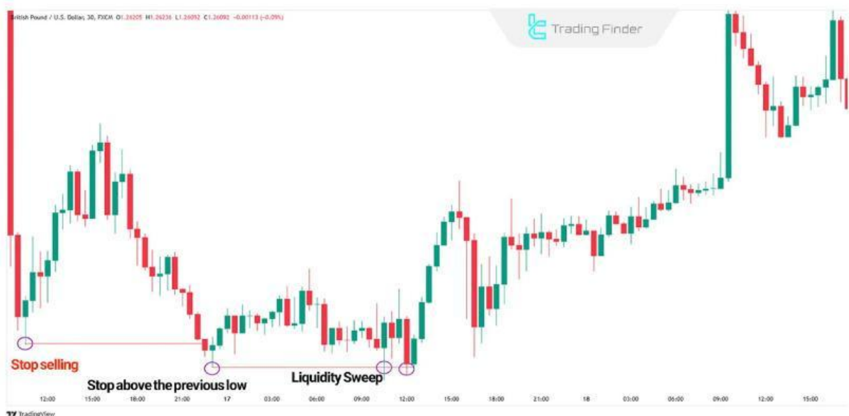
Illustration of three steps to mastering sell-side liquidity in forex trading