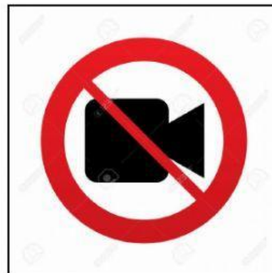
Camera off Turn off your camera