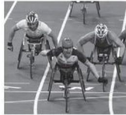
1 the fastest

the best the dirtiest the fastest the hottest the most dangerous the oldest