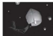
5 a lantern / firework