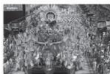
3 a funfair / parade