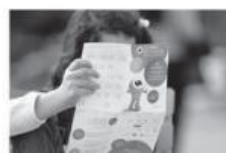
8 a parade / programme