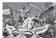
4 a parade / float