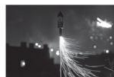
9 a firework / lantern

One of the biggest festivals in Japan is the Gion Festival in Narita, a small town near Tokyo. It's a celebration of the summer. There are colourful 1 decorations all over the town and people dress up in traditional Japanese 2 _____. Visitors can enjoy food and drink at the many 3 _____ in Narita's narrow streets. The best part of the festival is when decorated 4 _____ with people on them are pulled through the streets to Narita's main temple. The streets of Narita are beautiful at night when they are lit up by 5 _____ on the sides of the buildings.