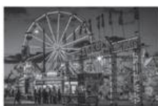
7 a programme / funfair