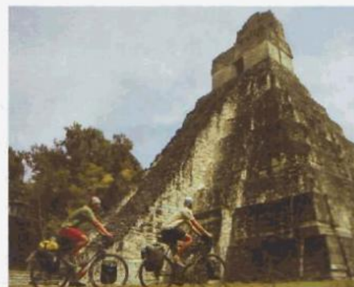
▲ Gregg and Brooks (right) cycle past ruins in Tikal National Park, Guatemala.