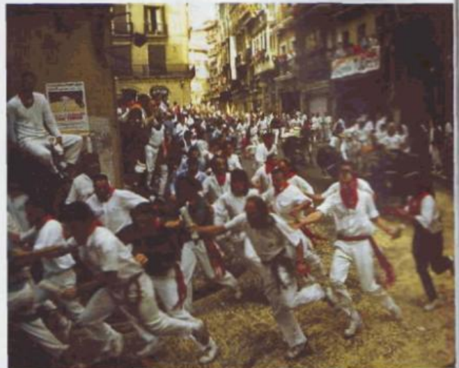
▲ People wearing red and white run from the bulls in Pamplona, Spain.

For some runners, it is a test of 9. _____. For others, the run makes them feel alive.