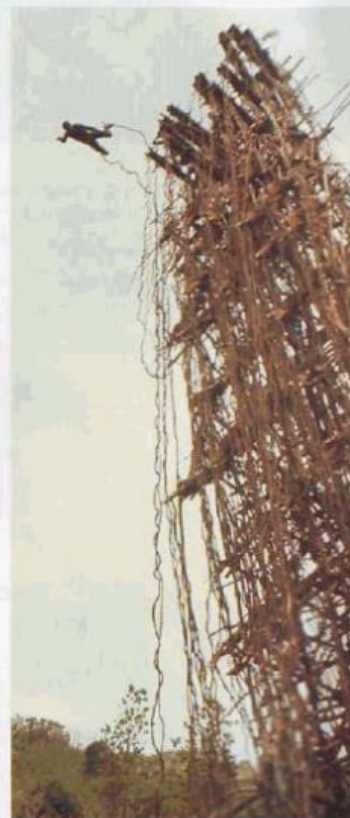
▲ A man jumps from a tower on Pentecost Island.