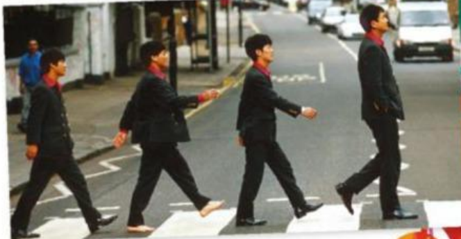
Japanese Beatles tribute band

In 2012, they were onstage in Manchester, England with a famous British band called the Arctic Monkeys. In 2013, the Parrots were onstage in Tokyo with Paul McCartney