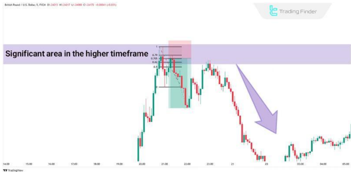
MSS and MSB-free trading strategy on the GBP/USD 5-minute chart

In the example below, the entry point is determined using OTE levels .