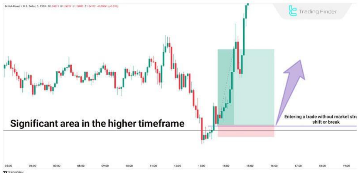
Example of trading without market structure shift using FVG

In the following example, the entry point is identified via using FVG .