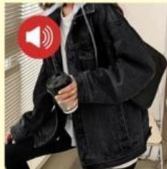
Black Denim Jacket