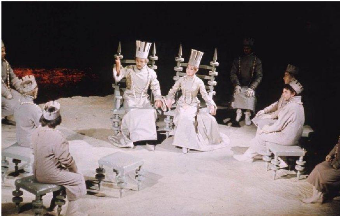
Royal Shakespeare Company, 1967