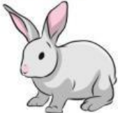
A RABBIT CAN'T