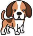
A DOG CAN