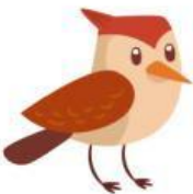
A BIRD CAN'T