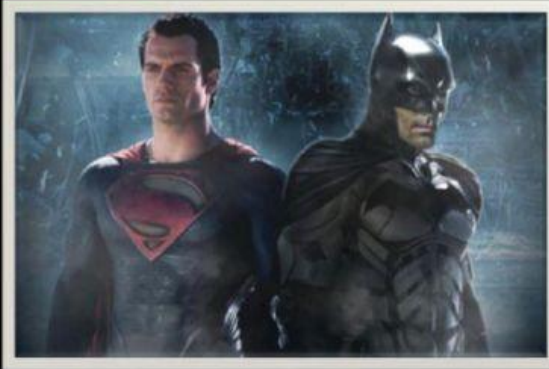
Superman serious Batman