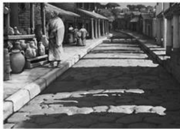
2 street / theatre