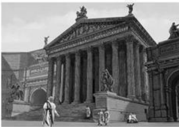
1 gate / town hall