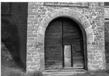
4 market square / gate