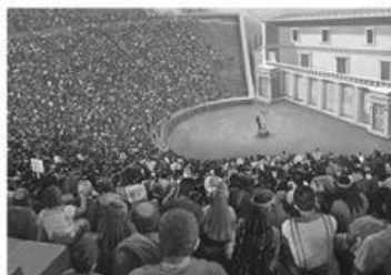
5 theatre / street