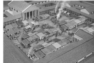
3 market square / walls