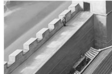
6 walls / town hall