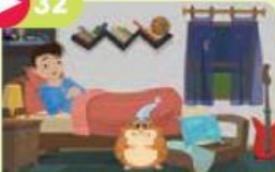
6.2 Grammar animation