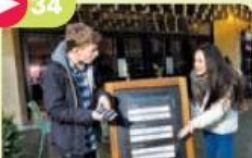
6.4 Communication video