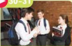
6.2 Grammar video