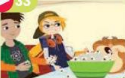
6.3 Grammar animation