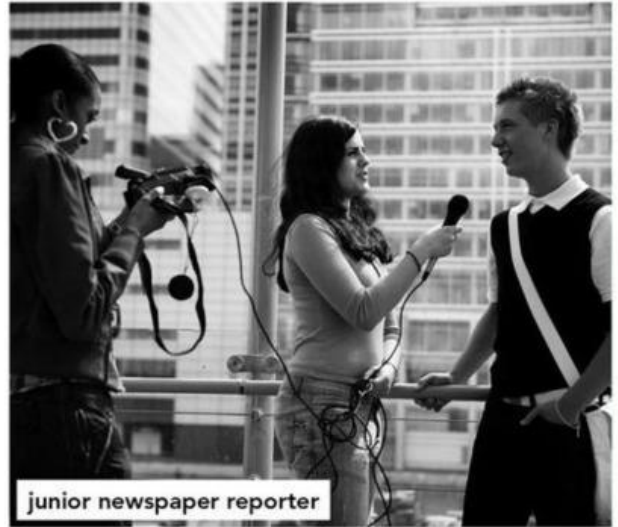
junior newspaper reporter