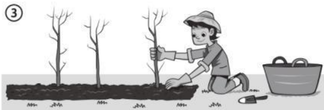
_____ planting trees.