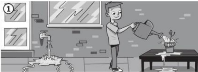
_____ He's wasting water.