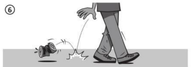
_____ dropping litter.