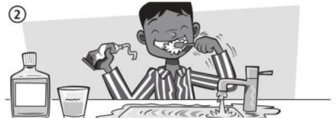
_____ saving water.