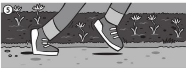
_____ stepping on flowers.