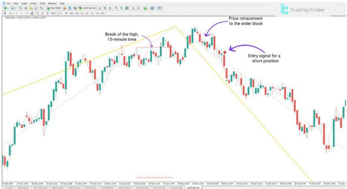
Judas Indices Indicator in a downtrend (USD/CAD)

In the 1-minute price chart of USD/CAD , the indicator identifies the high in the 15-minute time frame and, after its break by the price , moves toward the FVG with liquidity taken ; after the character change known as the " price gap " ( CHoCH ), the indicator shows an entry signal (Short) .