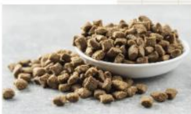
DRY CAT FOOD