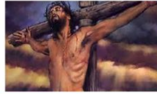
Jesus at Calvary

7. In Jesus' Transfiguration, who or what represents the prophets and laws of the Old Testament?