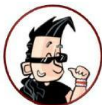
a. Mr. Star

This character has got short curly black hair. Who is it?