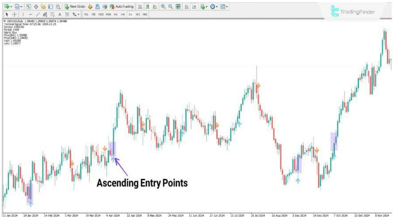
Prediction of the entry signal in the upward trend of the Gann signal indicator

The price chart below shows the EUR/GBP currency pair in a 1-minute timeframe. The blue arrows indicate buy entry points , especially near price bottoms or during an uptrend.