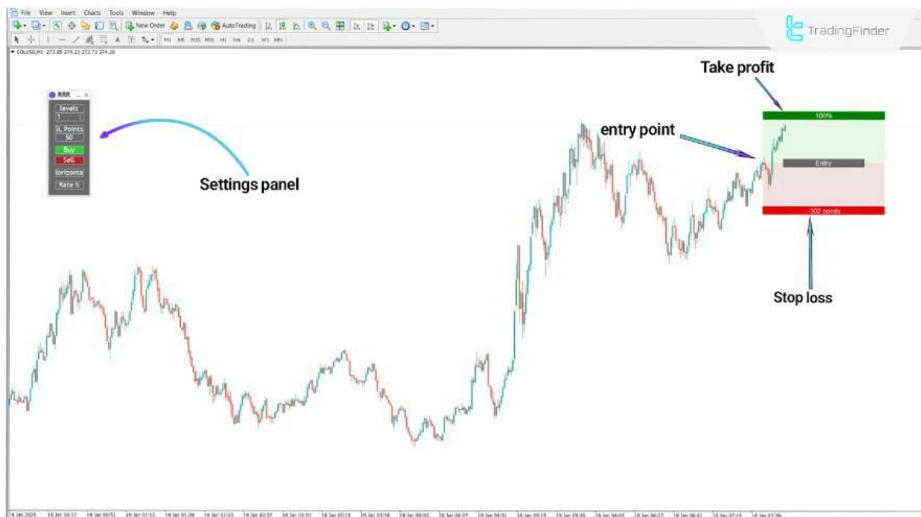
How to use the RRR tool in the bullish trend of Solana (SOL/USD)

In such conditions, this tool simplifies the determination of Stop Loss and Take Profit levels , considering the entry point .