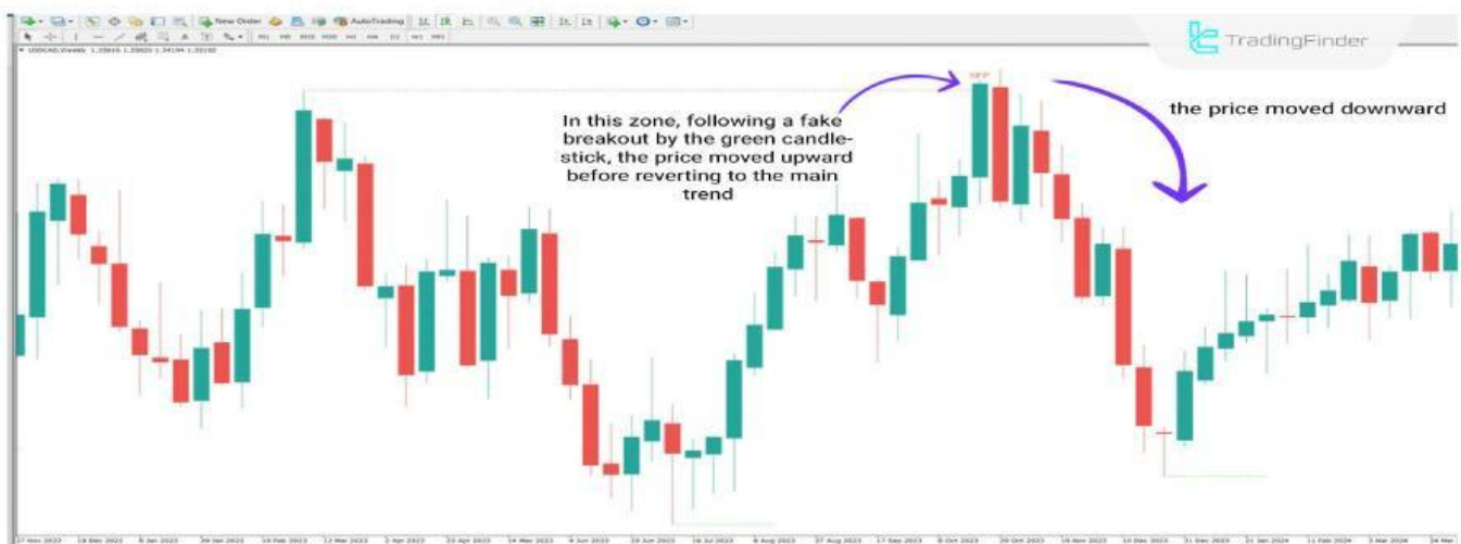
Swing Failure Pattern in Downtrend

The USD/CAD price chart in the weekly time frame is shown in the image. After reaching the highest peak , an SFP pattern forms with a fake break , gathering the necessary liquidity for the downtrend continuation .