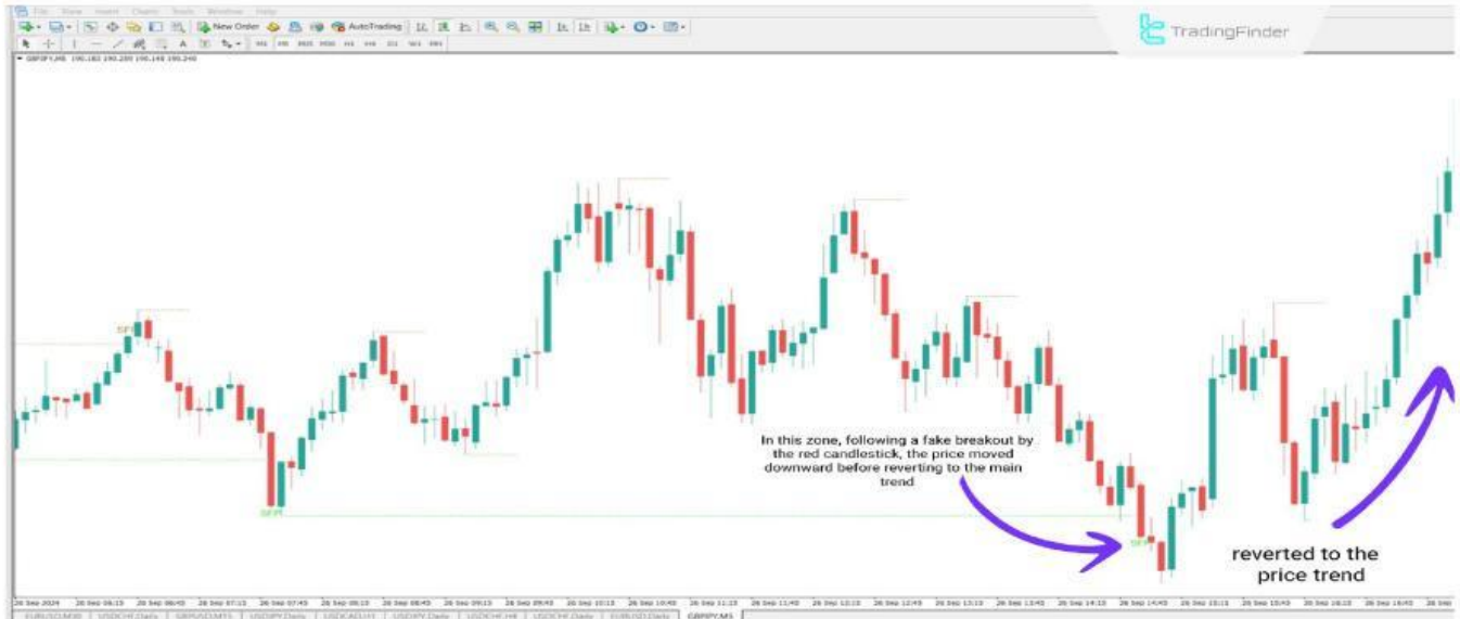
Swing Failure Pattern Indicator in Uptrend (GBP/JPY)

The chart below shows the GBP/JPY price chart in a 5-minute time frame ; after an SFP , the price moves with a red candle toward stop-loss activation and gathers the liquidity required to return to the uptrend .