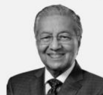
Mahathir Mohamad politician and physician

A country without _____ skill and knowledge will never become a developed country.