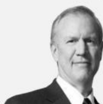
Bruce Rauner businessman and politician

Great teaching requires incredible talent and dedication, strong intellectual ability and _____ skill, real discipline and empathy.