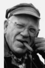
Eric Hoffer philosopher and social critic

Where there is the necessary _____ skill to move mountains, there is no need for the faith that moves mountains.