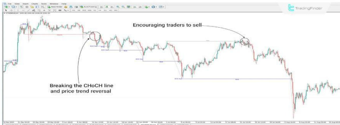
Performance of the Market Structure Indicator with Inducements in a Downtrend

Then, inducement detection at the gray IDM line leads to a sell confirmation in this area. The BOS breaks also clearly show the continuation of the price trend.