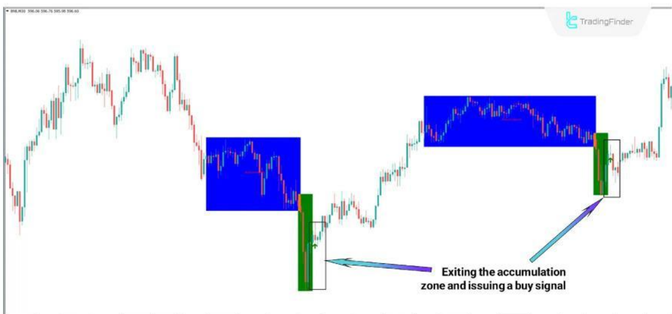
Power of Three Indicators on the BTC Price Chart

The ATR measures the average market volatility over the trader's desired period.