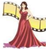
a film star