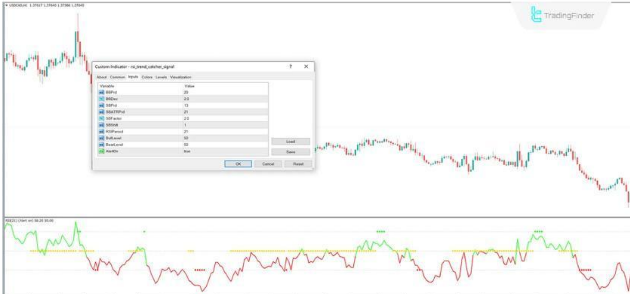
RSI Trend Catcher Indicator Settings

This section includes options for modifying the display parameters of the tool: