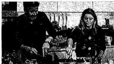
2 c _ _ k _ r _ y pr _ gr _ mm _