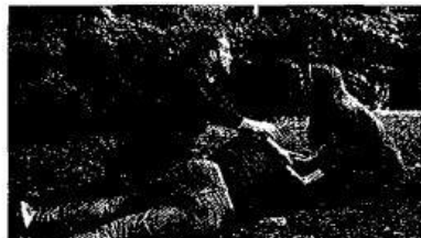
1 cr _ i _ m _ e _ d r _ a _ m _ a _

a Complete the words with the missing vowels, a, e, i, o, or u.