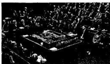
4 c _ rr _ nt _ ff _ rs pr _ gr _ mm _