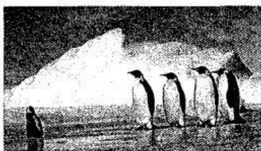
6 d _ c _ m _ nt _ ry

b Match the extracts to a type of programme from the list.