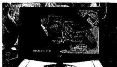
3 th _ w _ th _ r f _ r _ c _ st