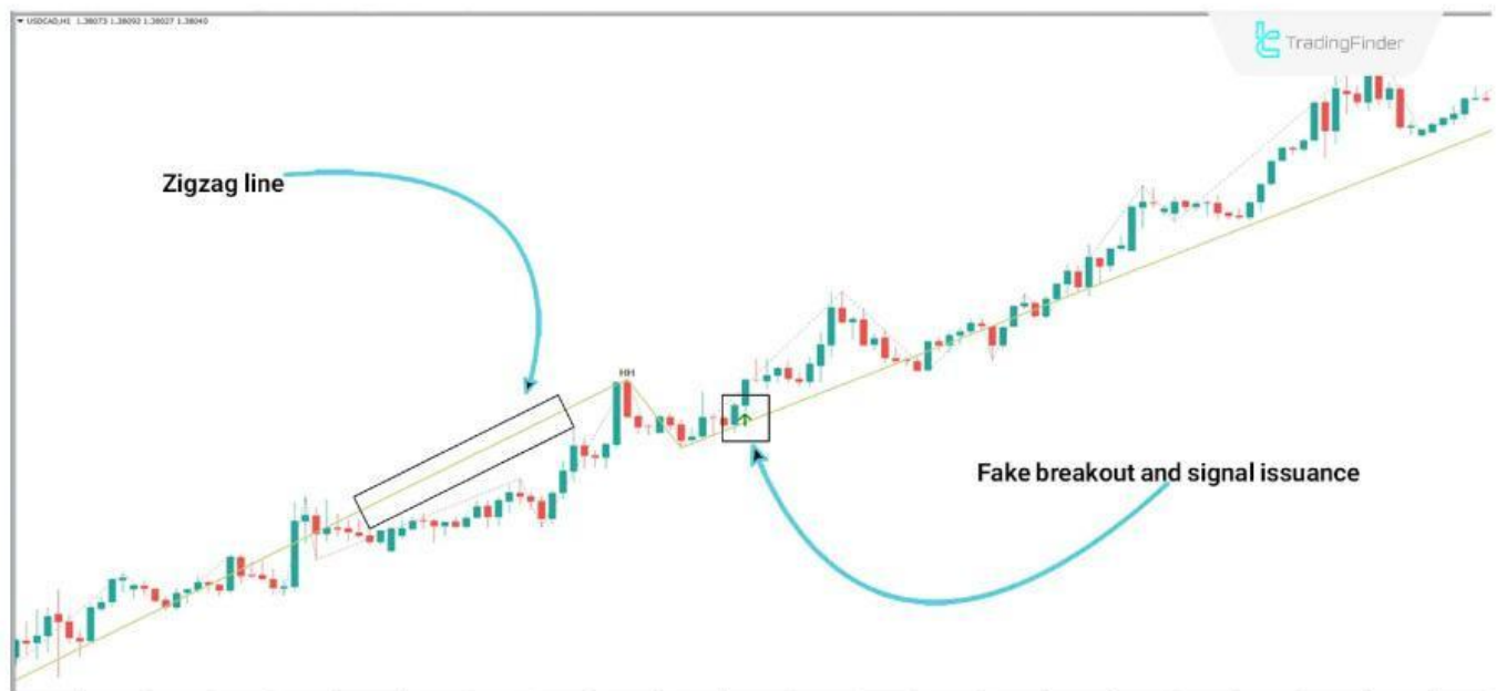
Performance of the Turtle Soup Indicator on the USD/CHF 15-Minute Chart

If the price rises above the support level, it indicates an opportunity to enter a long position , as the breakout is fake, and the price is likely to reverse upward.