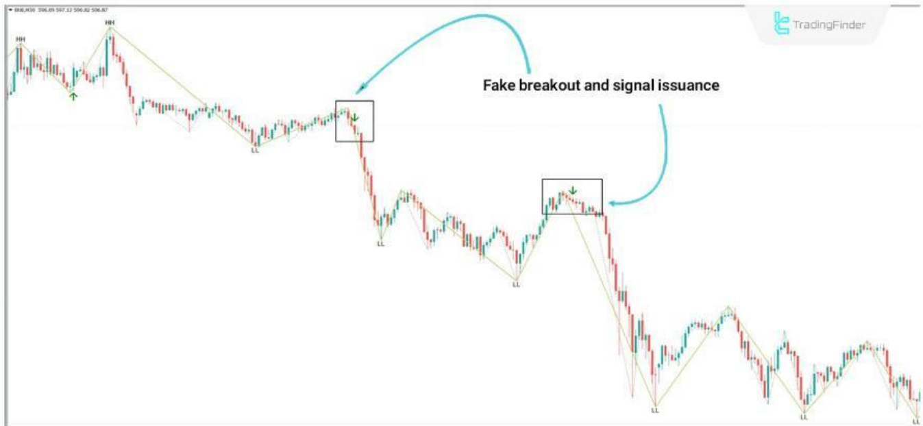
Performance of the Turtle Soup Indicator on the GBP/USD 5-Minute Chart

According to the price chart of Binance Coin in the 4-hour timeframe, the price has broken above the resistance level. The Turtle Soup pattern detects this breakout and signals a sell trade with a green arrow .