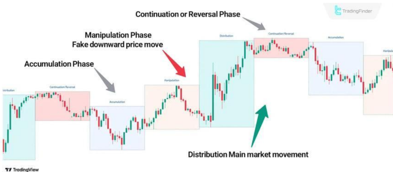
"XAMD/AMD" Strategy in a Bullish Trend

However, as soon as the price entered the distribution phase, it began its main move as an upward trend.