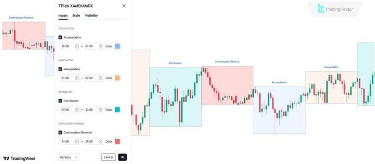
Overview of Indicator Settings