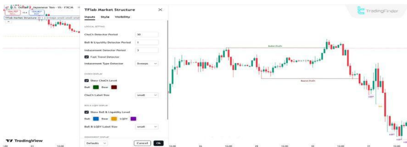
Reviewing Market Structure Inducements Indicator Settings