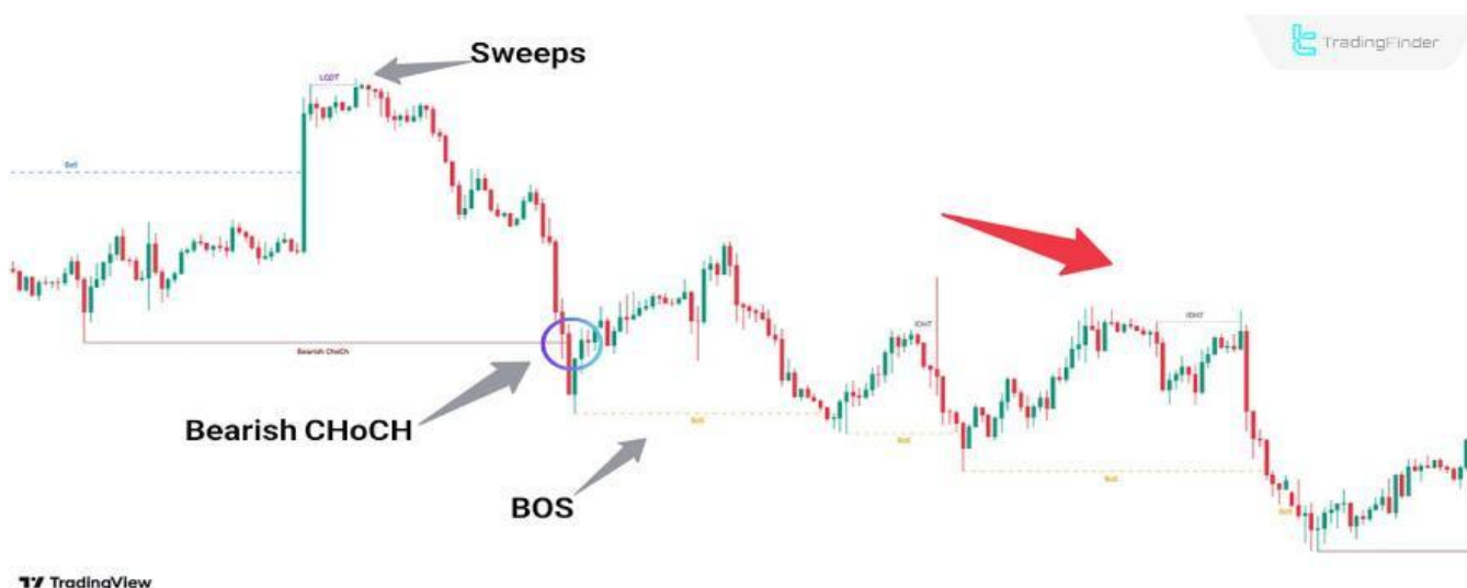
Market Structure Performance in a Bearish Trend

Successive BOS formations highlight the strength and continuation of the bearish trend.