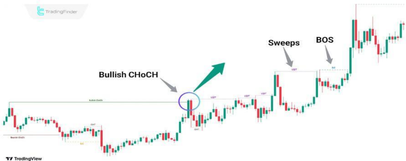
Market Structure Performance in a Bullish Trend

Finally, the indicator uses blue dashed lines to mark a BOS , indicating the continuation of the bullish trend.