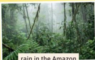
rain in the Amazon