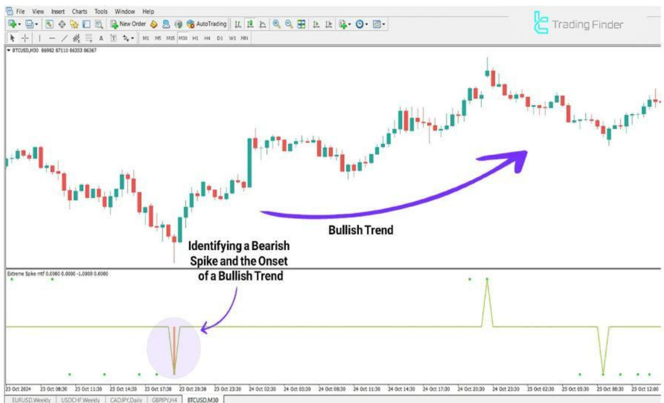
Bullish Trend with Bearish Spike (BTC/USD)

Such conditions can signal the potential for price rebounds and upward movements. Traders observing negative spikes and other confirmation signals can identify optimal buying opportunities .