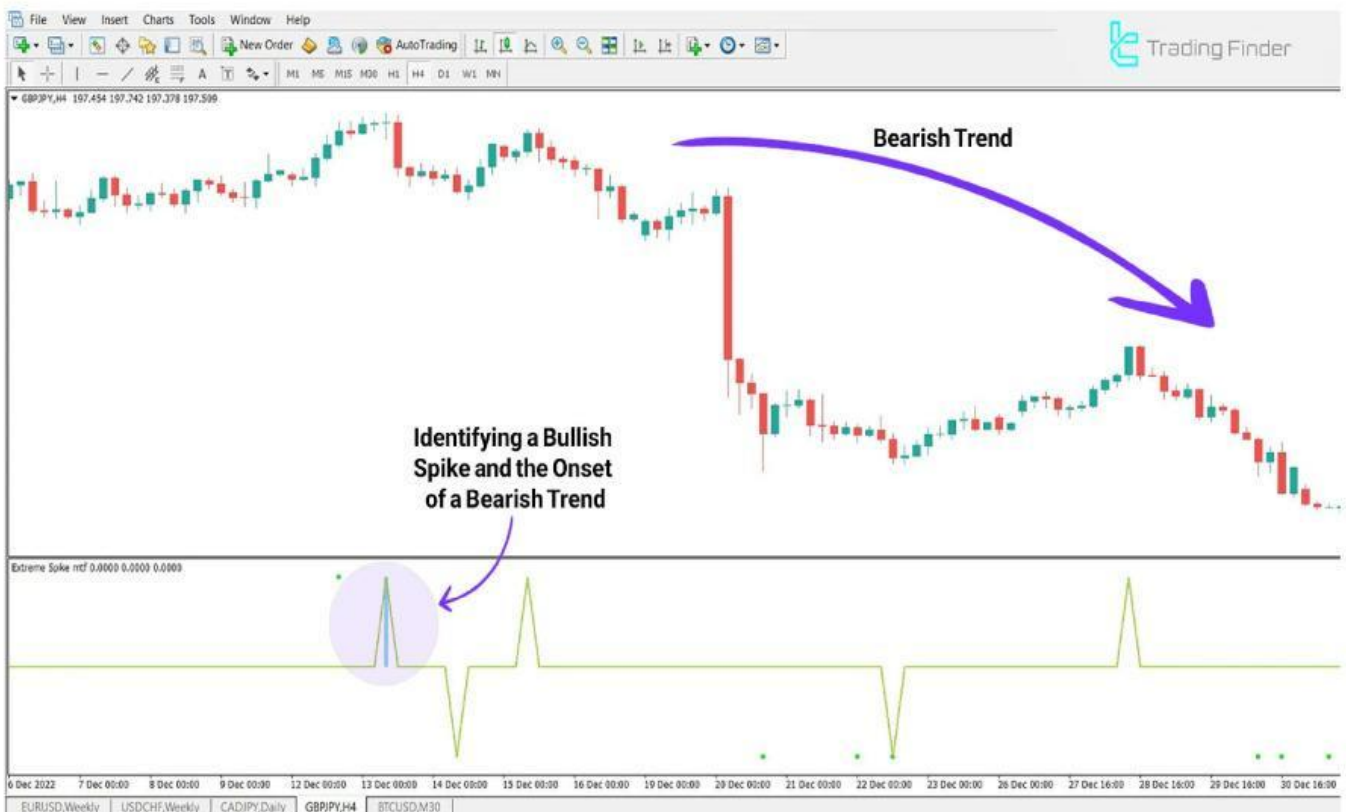
Bearish Trend with Bullish Spike (GBP/JPY)

Traders can use positive spikes with other confirmation signals to identify selling opportunities .