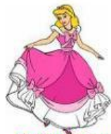
fifty years ago