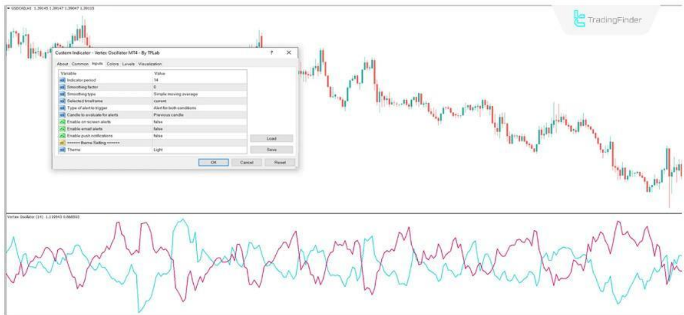
Vertex Indicator Settings