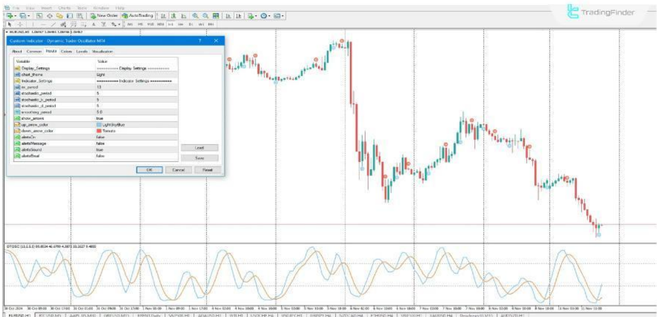
EUR/USD 1-Hour Chart