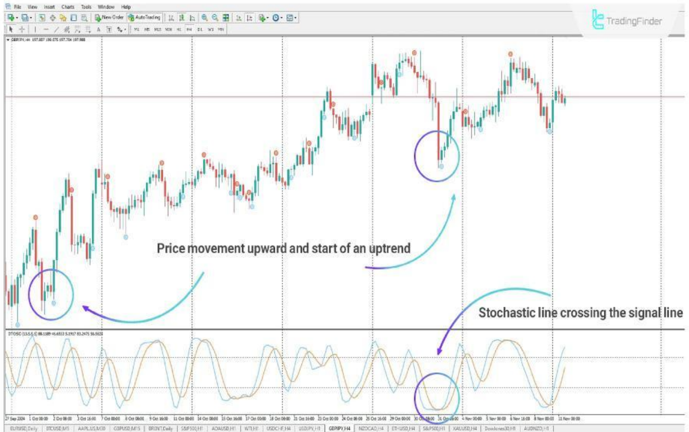
GBP JPY 4-Hour Chart

In the 4-hour GBP/JPY chart, the Dynamic Trader Oscillator has issued a buy signal . When the oscillator line (blue) crosses the signal line upward, a buy signal is displayed with blue markers on the chart. After issuing this buy signal, the price enters a sharp upward trend.